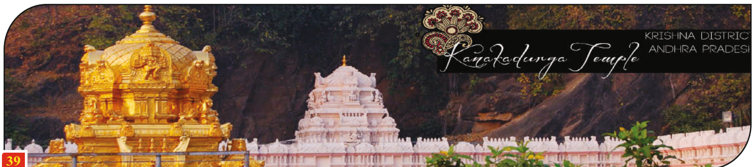
Andhra Pradesh Tourism strongly believes in the industry