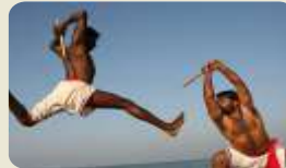
KERALA MARTIAL ARTS