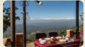
stay at MADIKERI