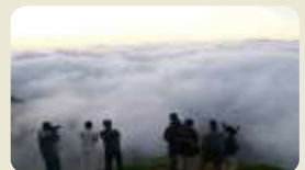
LAKKIDI VIEW POINT