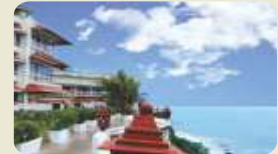
stay at KANNUR