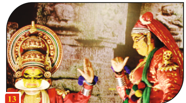
Last of Kerala visit - Kathakali കഥകളി