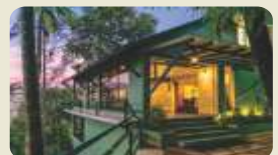
stay at VYTHRI