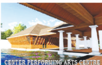
CENTER PERFORMING ARTS CENTRE

Edava - Kappil beaches, Kappil Lake and water sports Centre, Priyadarshini boat club, Puthenkulam Elephant ride, Jatayupara Nature Park (with world's Largest bird sculpture) (new), Golden island, Anjengo Fort, Varkala T. S Canal.