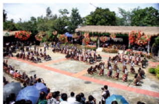
Venue for Anthurium Festival