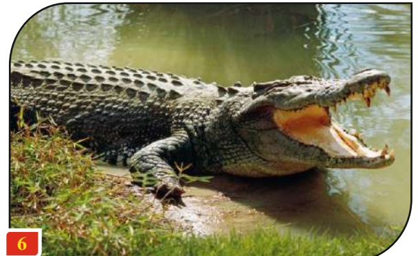
Wildlife Conservation Initiatives by Indian Government