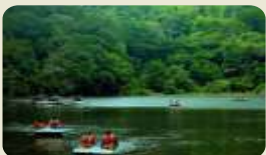
SOOCHIPPARA WATER FALLS