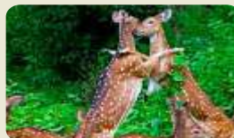
WILD LIFE SANCTUARY