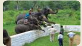
DUBARE ELEPHANT CAMP