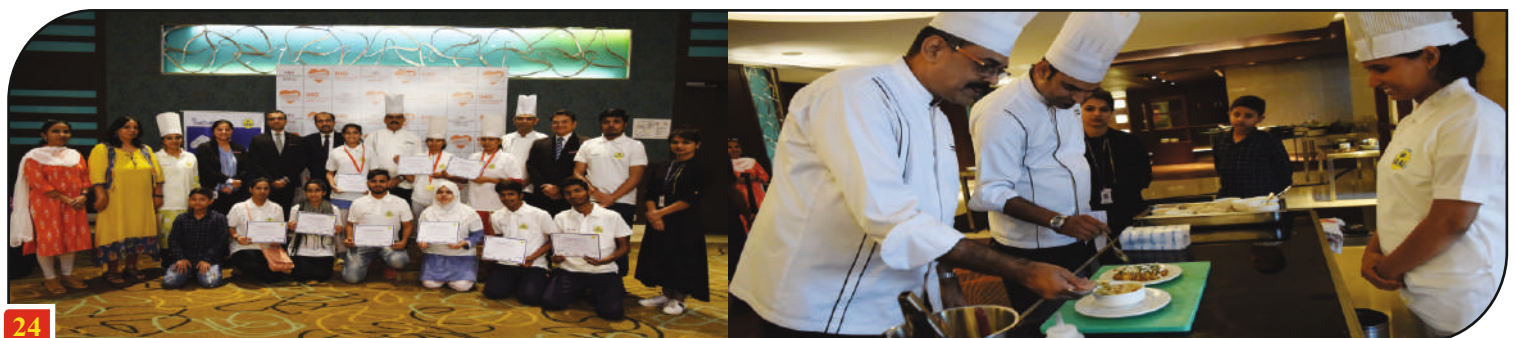
Crowne Plaza Greater Noida hosts National Abilitylympics for specially-abled