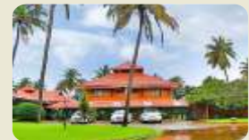
stay at NEELESWARAM