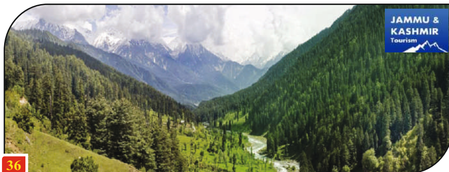
Pahalgam, popular as the valley of shepherds