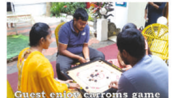
Guest enjoy carroms game