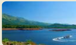
BANASURA SAGAR DAM